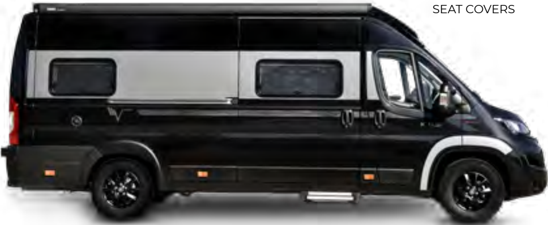
AUTOMOTIVE STYLE REAR WINDOWS