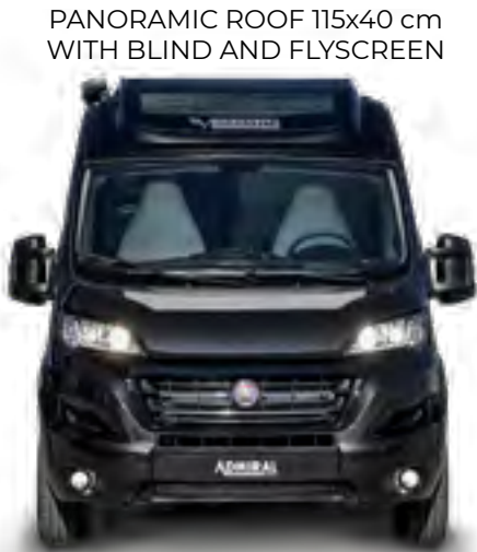
PANORAMIC ROOF 115x40 cm WITH BLIND AND FLYSCREEN

The perfect blend of aggressive styling and driving pleasure.